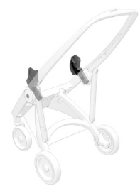
Car Seat Adapters