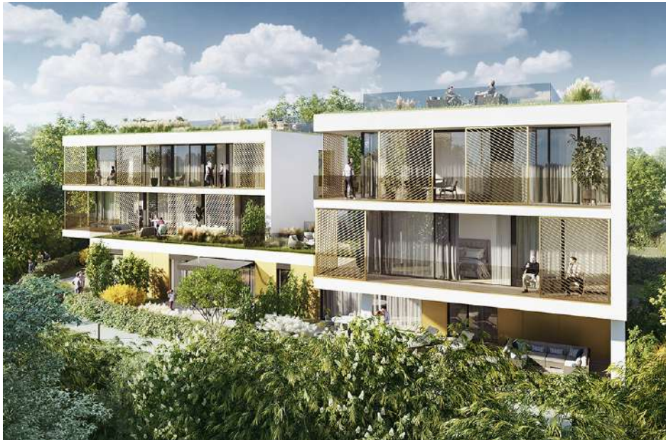
PARK VISTA ZBRASLAV