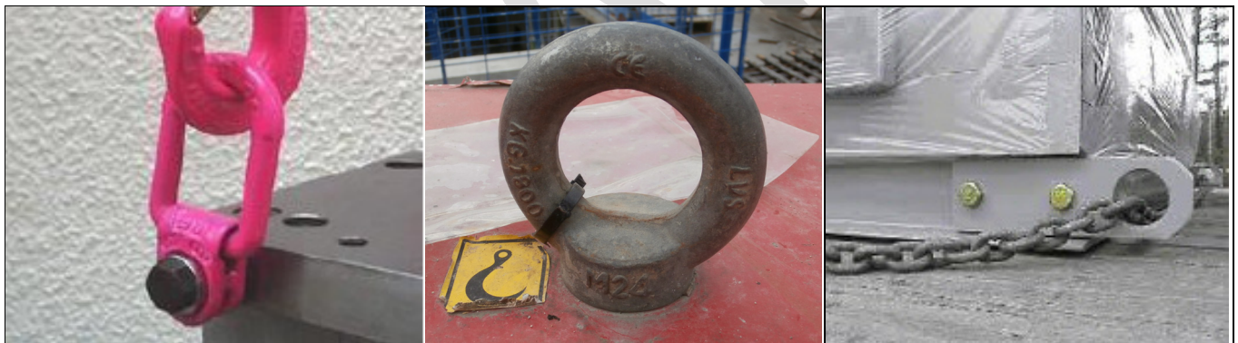
Figure 1 - Examples of Removable Lifting Eyes