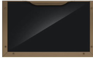
9005 JET BLACK