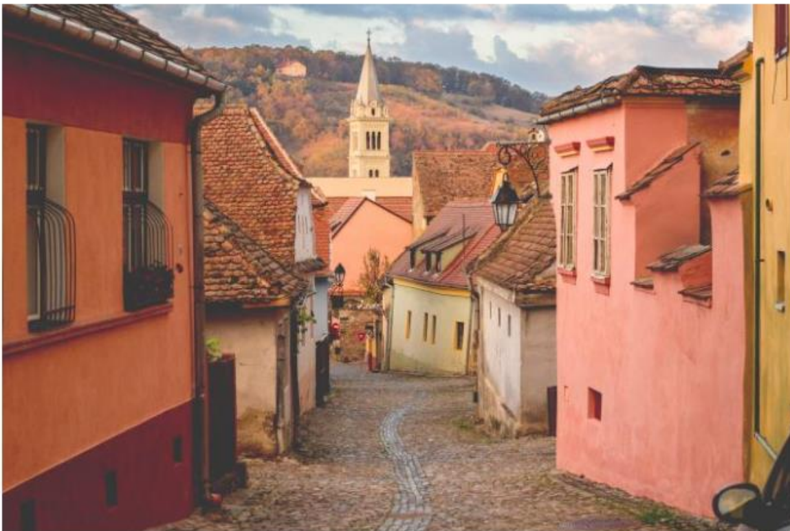
Sighisoara, Transylvania

Details A night in the two-bedroom Grand Art Gallery, owned by a private, contemporary collector near Piazza Navona, costs from €369 ( thegrandhouse.com )