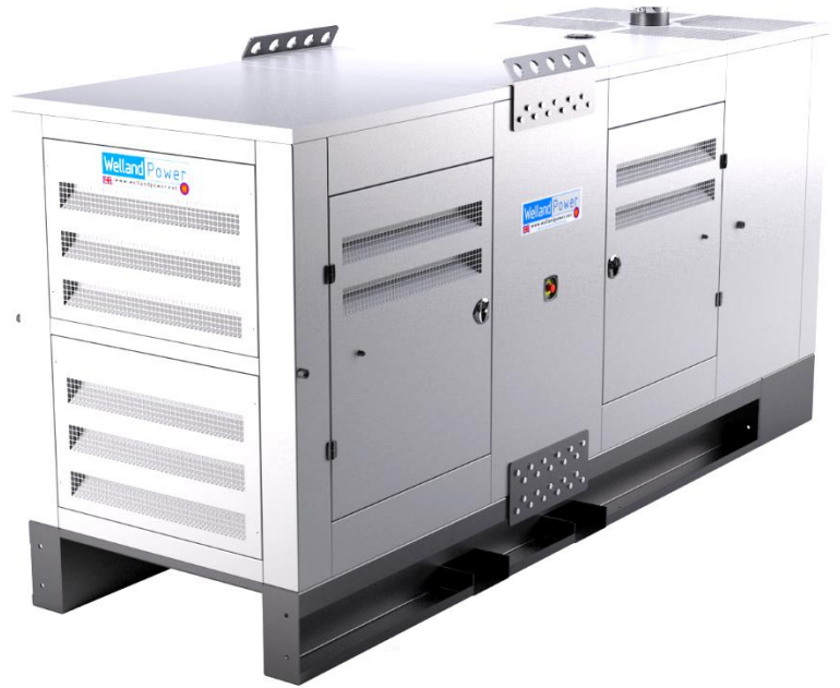
WP200-WP300, Three Phase, 200-330kVA