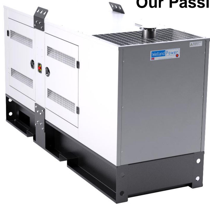
WP140-WP200, Three Phase, 140-200kVA