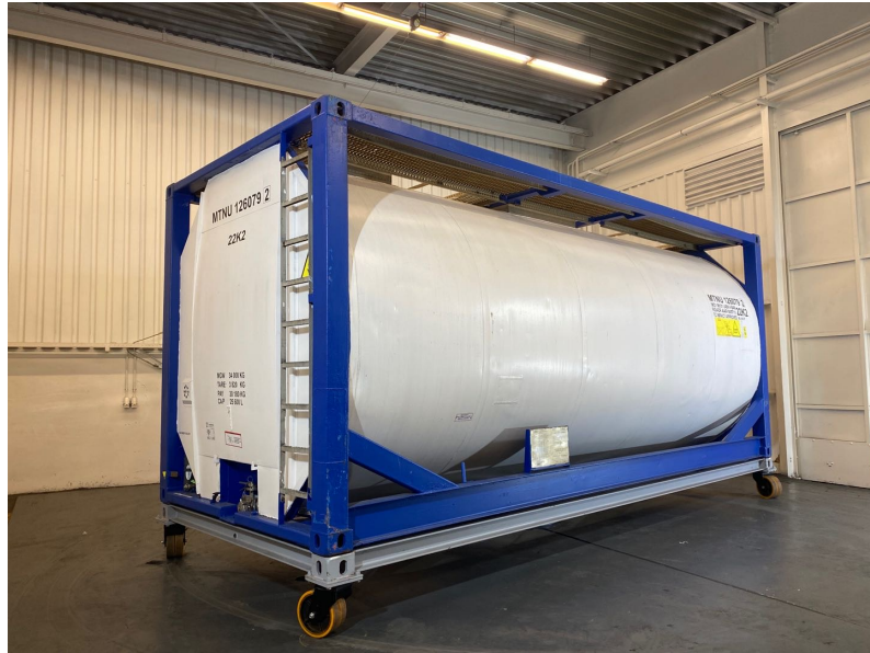
Front - left hand side