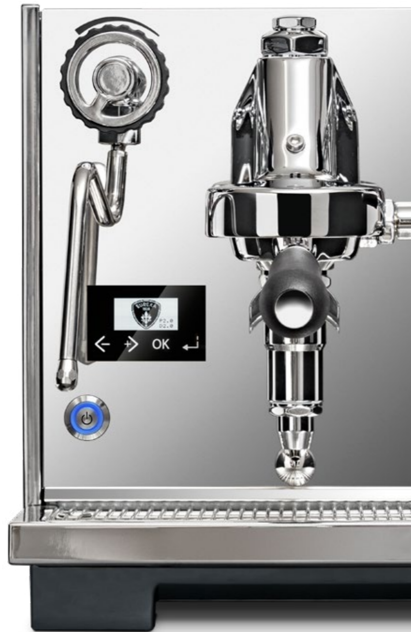
Designed by Studio Paoli Milano