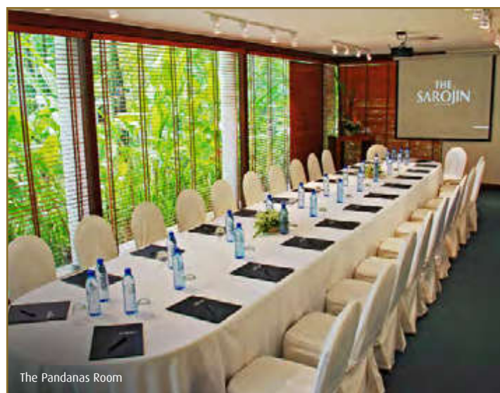
The Pandanas Room

The Beach, Ficus, Edge and The Lawn – Ideal venue for dining function, cocktail party, wedding ceremony and reception