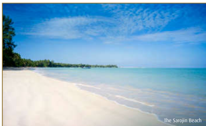
The Sarojin Beach

Situated just an hour from Phuket International Airport in Khao Lak on a secluded 11km white sandy beach. Ideal for couples, romantic breaks, honeymoons, weddings and older family groups. Designed in a contemporary Asian style with just 56 luxurious guest residences. Wide range of activities and facilities – snorkel, SCUBA or cruise on a luxury boat, jungle adventures complete with champagne, glimpse authentic Thai local life in association with responsible and sustainable tourism commitment, rejuvenating spa massages lulled by the sounds of the Andaman sea, Thai cooking classes, lazy gourmet lunches, romantic dinners on a secluded beach or by a candlelit jungle waterfall ...the limits are only your imagination. No children under 10 years permitted to stay.