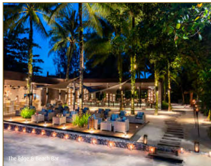
The Edge & Beach Bar

Breezy, chic and stylish, with spectacular views across its gorgeous beach and sea views. Dine on Thai and seafood delicacies, sink into tropical inspired loungers or comfy sofas - perfect for sipping a chilled cocktail or just relaxing.