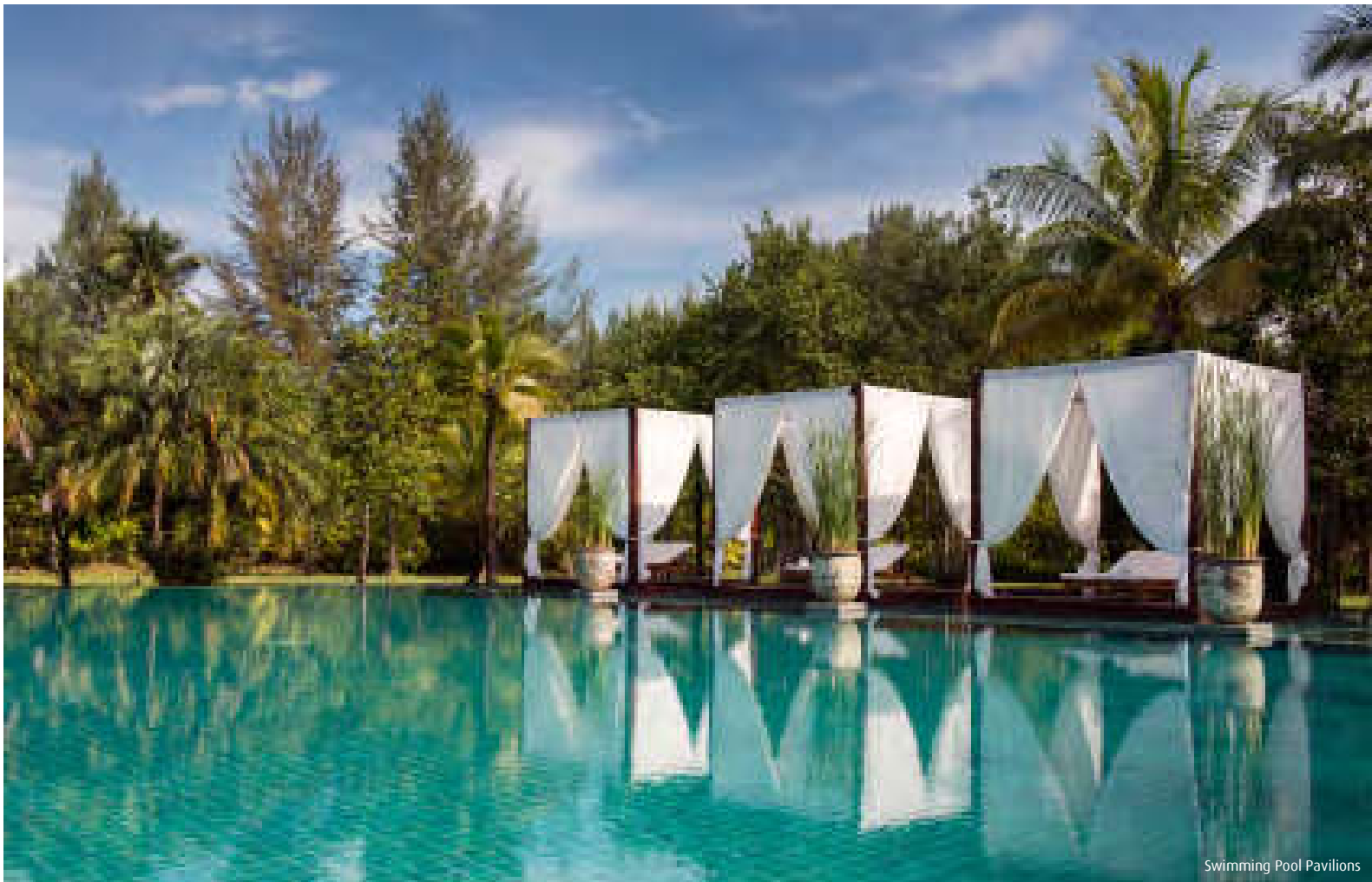
Swimming Pool Pavilions