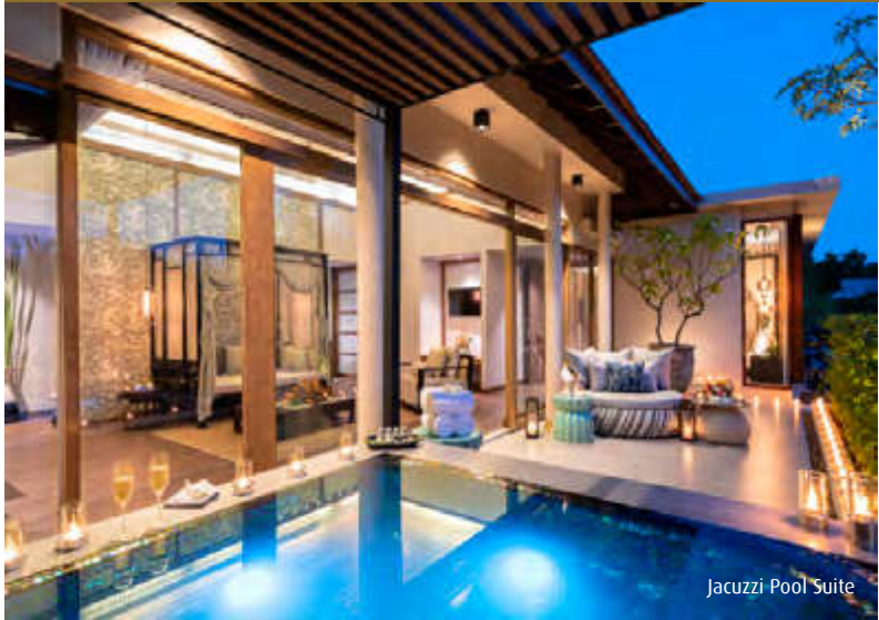
Jacuzzi Pool Suite