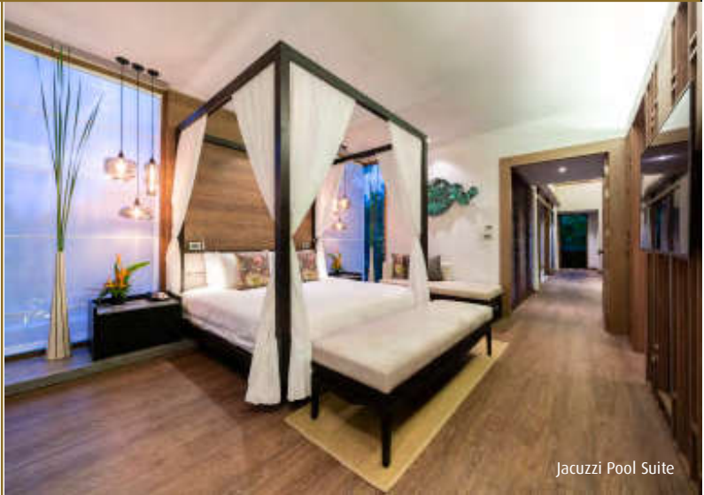
Jacuzzi Pool Suite