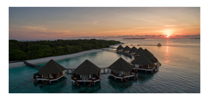
ADAARAN PRESTIGE WATER VILLAS