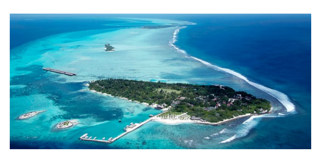
ADAARAN SELECT HUDHURAN FUSHI