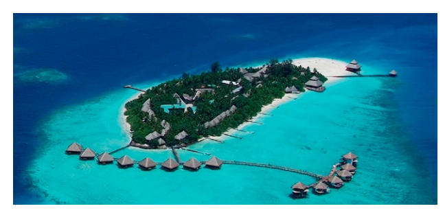
ADAARAN CLUB RANNALHI