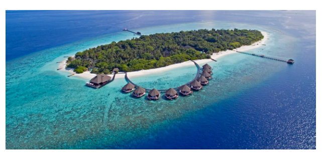
ADAARAN SELECT MEEDHUPPARU