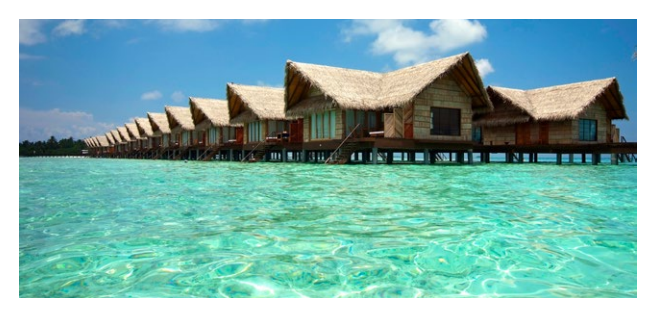
ADAARAN PRESTIGE OCEAN VILLAS