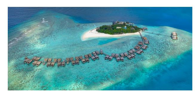
ADAARAN PRESTIGE VADOO