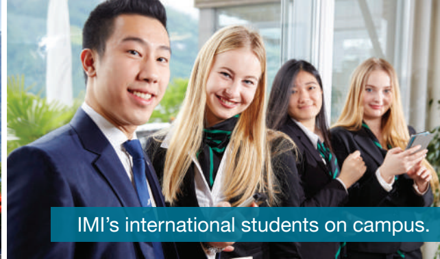
IMI's international students on campus.