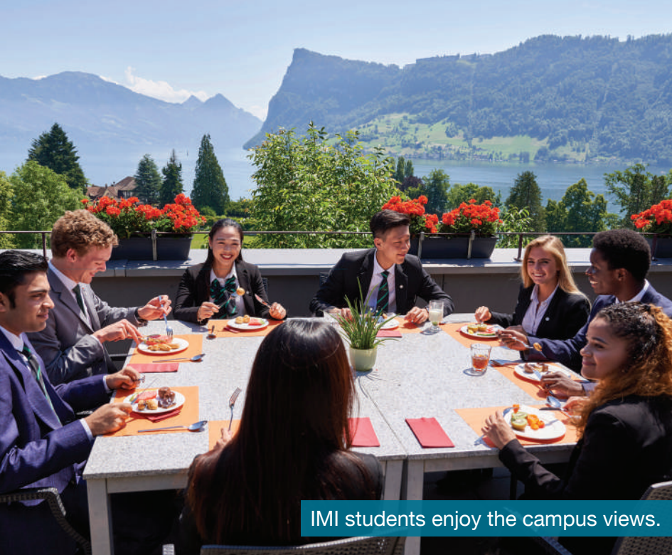
IMI students enjoy the campus views.