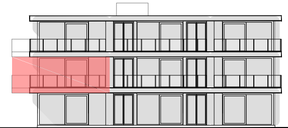
BLOK B ZUIDOOST GEVEL