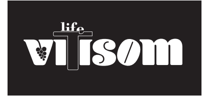
3) LOGO WHITE