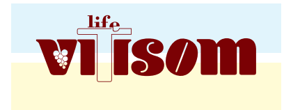
SUITABLE ON NEUTRAL TONES