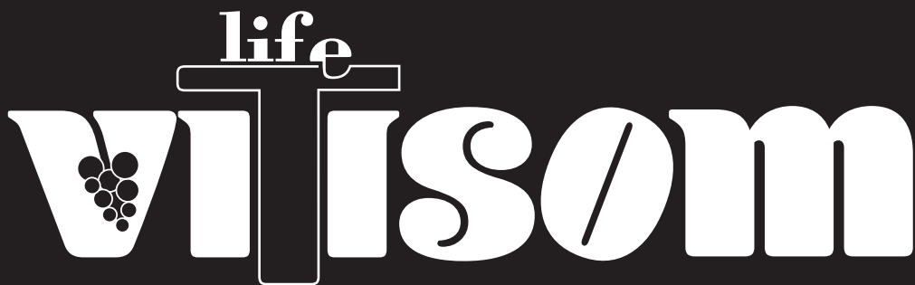
3) LOGO WHITE