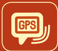
Navigation with voice recognition