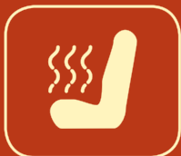
Heated front seats