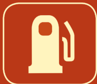
Surprising fuel efficiency*