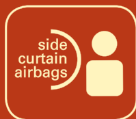
Side curtain airbags