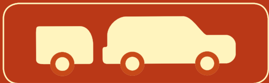
Integrated Class III trailer hitch

*17/23/19 EPA-estimated city/hwy/combined mpg for Pilot 2WD models. 16/22/18 EPA-estimated city/hwy/combined mpg for Pilot 4WD models. Use for comparison only. Actual mileage may vary. **Compatible only with Bluetooth® HandsFreeLink®-compatible phones.