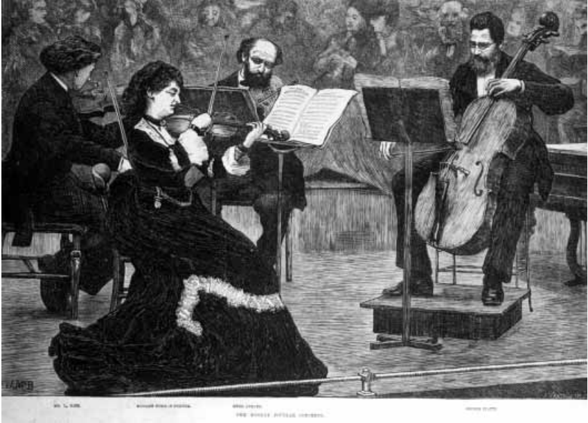
Figure 1.2 Quartet performing at the Monday Popular Concerts in St James's Hall, London; from an engraving in the Illustrated London News (2 March 1872). The players are Madame Norman-Neruda (violin 1), Louis Ries (violin 2), Ludwig Straus (viola) and Alfredo Piatti (cello)