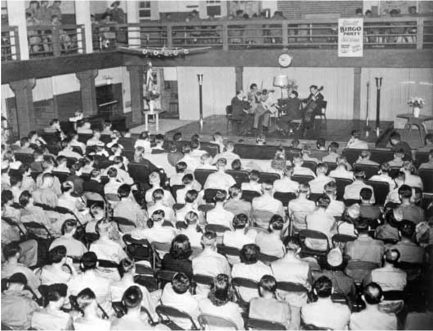
Figure 1.4 The Budapest Quartet playing to the United States Army Air Forces Technical School in Colorado during World War II

by luck or by judgement, the record companies were making significant investments in much of the chamber repertoire; the range of music explored was considerably enlarged, reinforcing hierarchies of works (including, of course, quartets) and artists in the process. 30 And like concert-givers before them, record companies found that ensembles were relatively cheap to hire, and usually came pre-rehearsed. Besides, the music itself would endure.