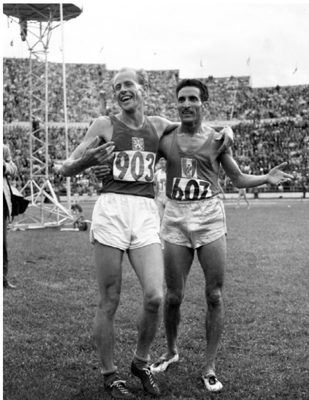
Emil Zátopek and Alain Mimoun at the Summer Olympics in Helsinki 1952

You can find a regularly updated programme on our website here .