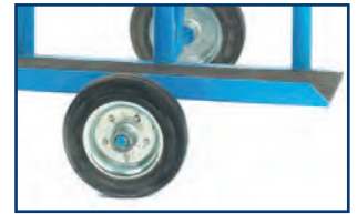
Rubber Matted Platform