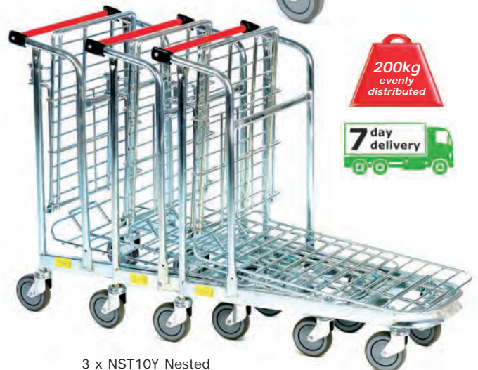
3 x NST10Y Nested