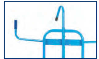
Adjustable Support Bar