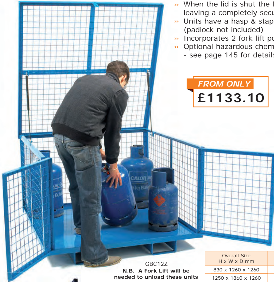
GBC12Z N.B. A Fork Lift will be needed to unload these units