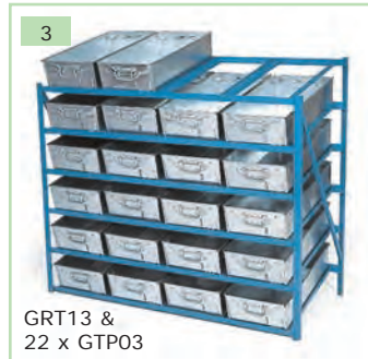
GRT13 & 22 x GTP03