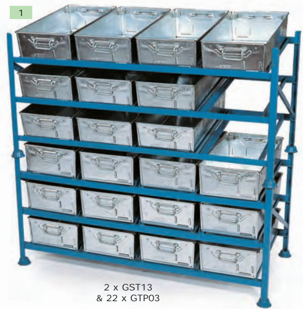
2 x GST13 & 22 x GTP03