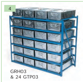
GRH03 & 24 x GTP03