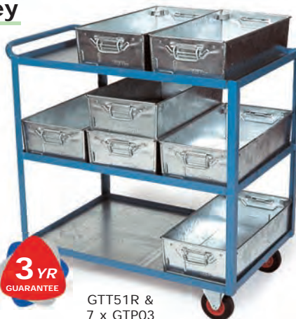
GTT51R & 7 x GTP03