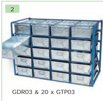
GDR03 & 20 x GTP03