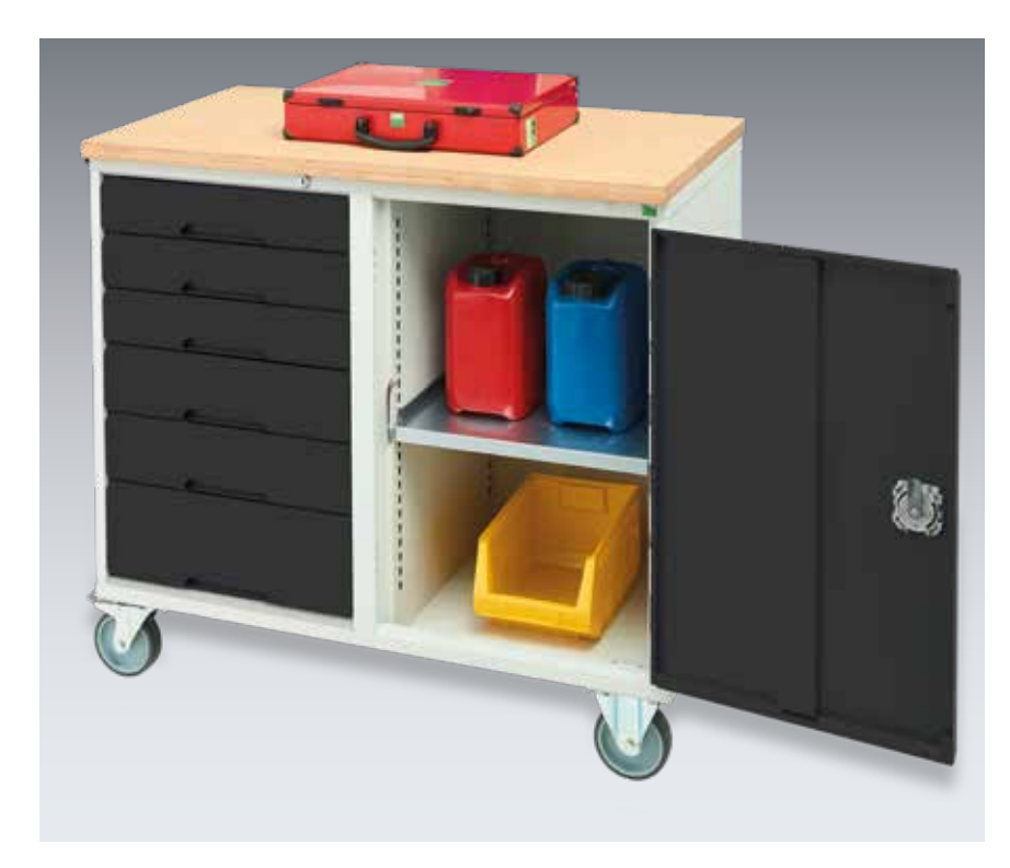
bott verso is also available with RAL7035 light grey, RAL3004 red, or RAL7016 anthracite (shown) fronts / doors.