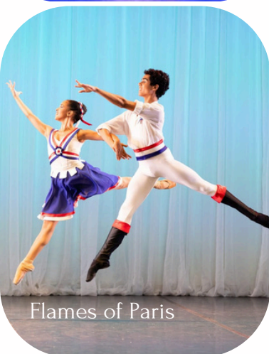
Flames of Paris