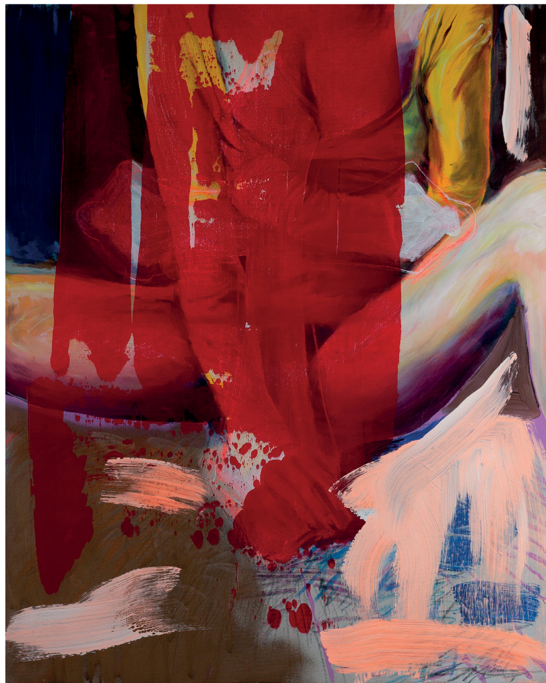
KINGDOM OF FEAR 2019 OIL ON CANVAS 95 X 75 CM